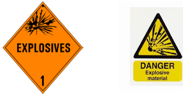
Figure 4: Clear, concise signage for Explosives