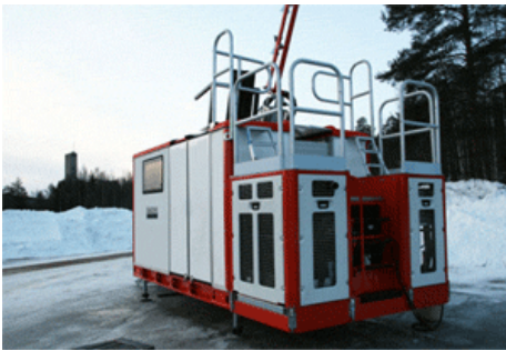
Figure 6: Drill Shack

fluids). Drill shacks shall be equipped with appropriate fire fighting equipment and with fire extinguishers located on both the interior and exterior of the building. Depending on the geology in the area where drilling is occurring, radon or radioactive radon progeny may build up within the drill shack. The employer should assess the potential for radon exposure prior to commencing drilling operations. Ventilation is critical to avoid exposure to gases, fumes and exhaust from equipment. An inspection and maintenance program must be developed and implemented based upon the manufacturer's requirements. For example, hydraulic hoses/couplings must be inspected on a regular basis and couplings must be tightened as per manufactures' specifications. Additionally, all maintenance work must be done by a qualified person utilizing appropriate lock-out/tag-out procedures.