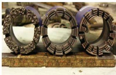
Figure 5: Diamond Drill Bits

Procedures shall be developed and communicated to all on site to address issues related to emergency response and must take into consideration inclement weather. A rod handling procedure shall be developed to address pre-drilling, production, maintenance, post-drilling and jammed rods. A written lock-out/tag-out procedure shall be developed and the workers trained in said procedure. Lock-out procedures must be used while carrying out maintenance work or repairs on drills. As well, all guards on belts, chains and gears must be replaced after removal for maintenance.