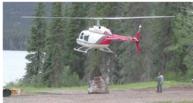
Figure 2: Helicopter Slinging a Load

The pilot of an aircraft is the captain and their instructions shall be followed at all times. They are personally responsible for the safety of the flight and should not be distracted while flying. An employer shall develop safe work procedures to be followed when around a helicopter, including proper helicopter approach by passengers and during slinging operations (see Figure 2), and ensure employees are trained in these procedures. The ground crew must always have direct communication with the pilot during slinging operations to ensure safe deposit of the materials. Transport Canada has developed a training video entitled “Keep Your Eyes on the Hook” that may be helpful in developing safe slinging procedures: http://www.youtube.com/watch?v=eESeTQVjOTY . The pilot and ground crew must be aware of and familiar with slinging procedures and hand signals, and have clear communication that is absolutely understood by all involved. Refer to sections 346 through to 361 of the OHS Regulations.