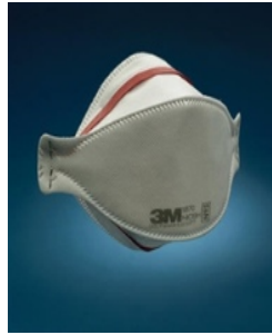
Figure 1: Respirator Masks