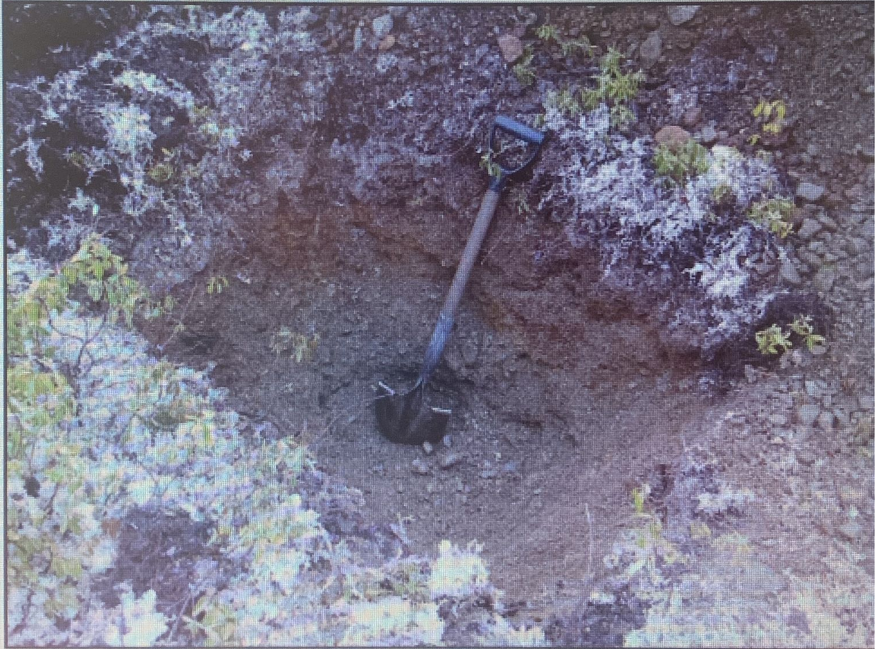
Plate 1. Gravel in a 1-m-deep hand-dug pit at the top of a 7-m-high glaciofluvial terrace near North West Brook.