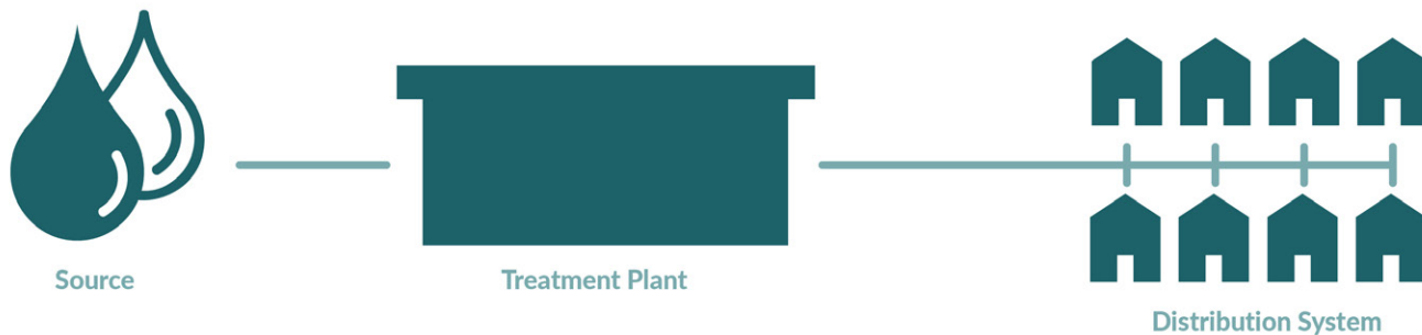
Figure 1: Water supply and distribution system

In drinking water supplies, the highest health risk is posed by potential pathogenic contamination, followed by chemical and physical contaminants. Certain water quality parameters can sometimes affect the look, taste, and smell of drinking water. Although these aesthetic water quality parameters do not impact health, they may affect people's acceptance and degree of trust in their public drinking water system and its safety.