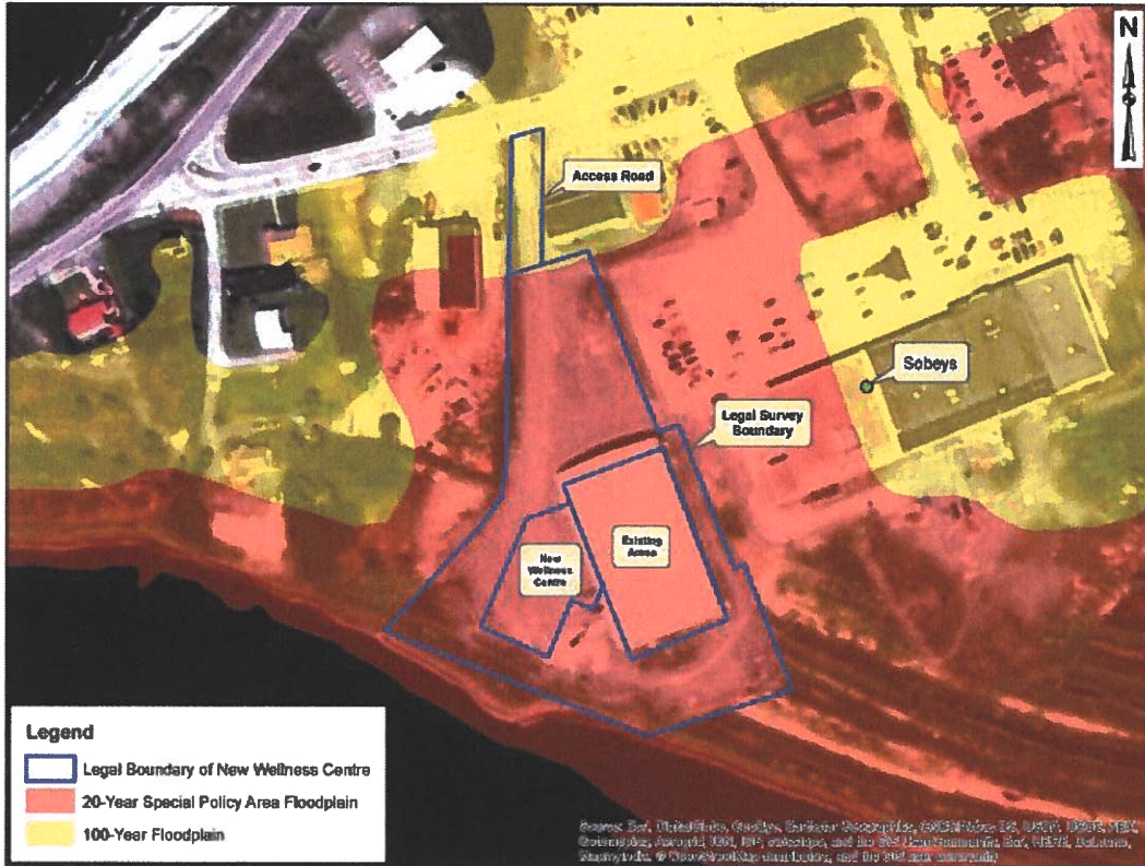
Designated Flood Plain Map for the Town of Placentia