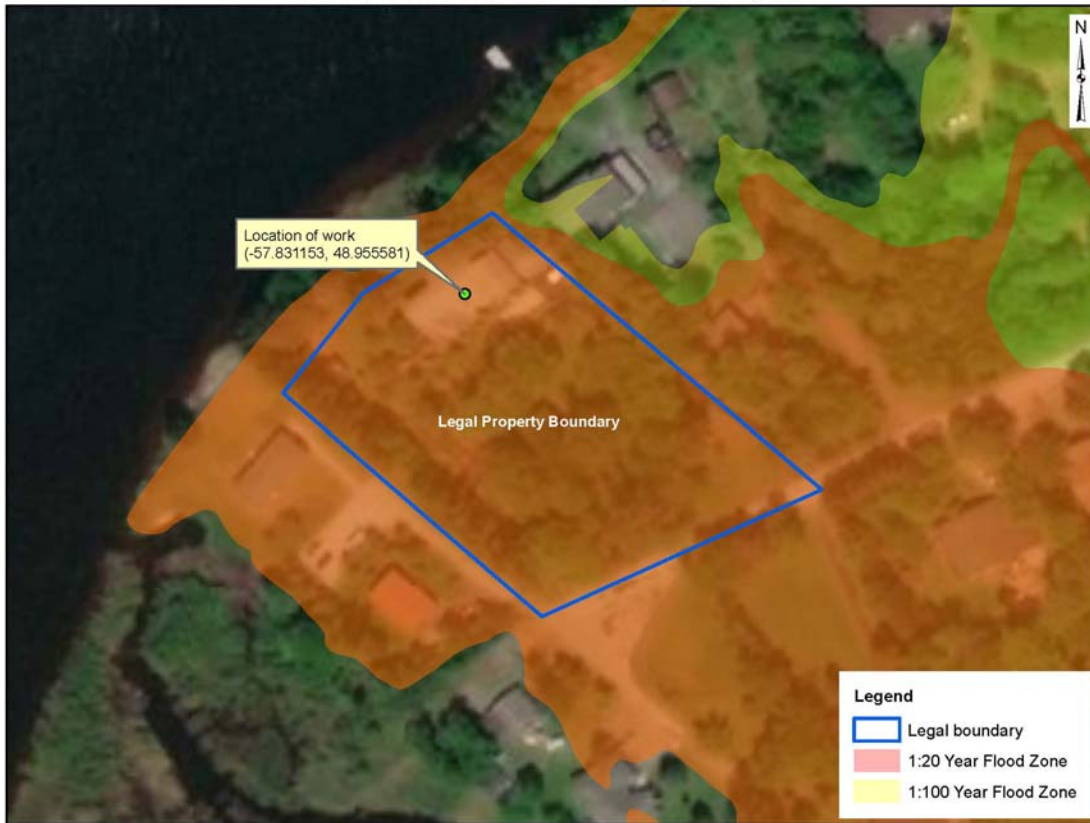
20 Forest Drive, Town of Steady Brook, NL