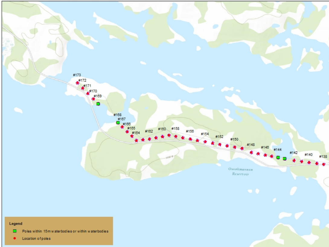
Churchill Falls Gabbro Line Location Map 1