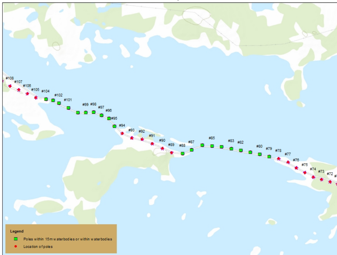
Churchill Falls Gabbro Line Location Map 3