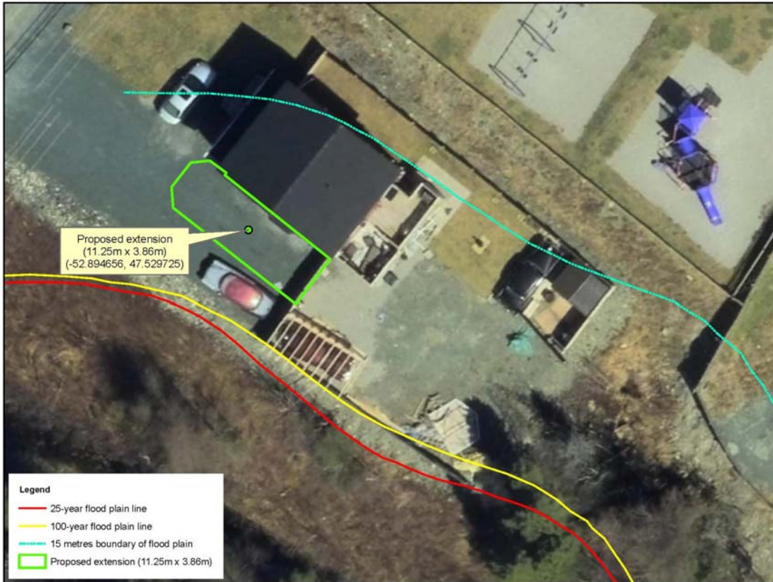
6 St. Thomas Line, Paradise