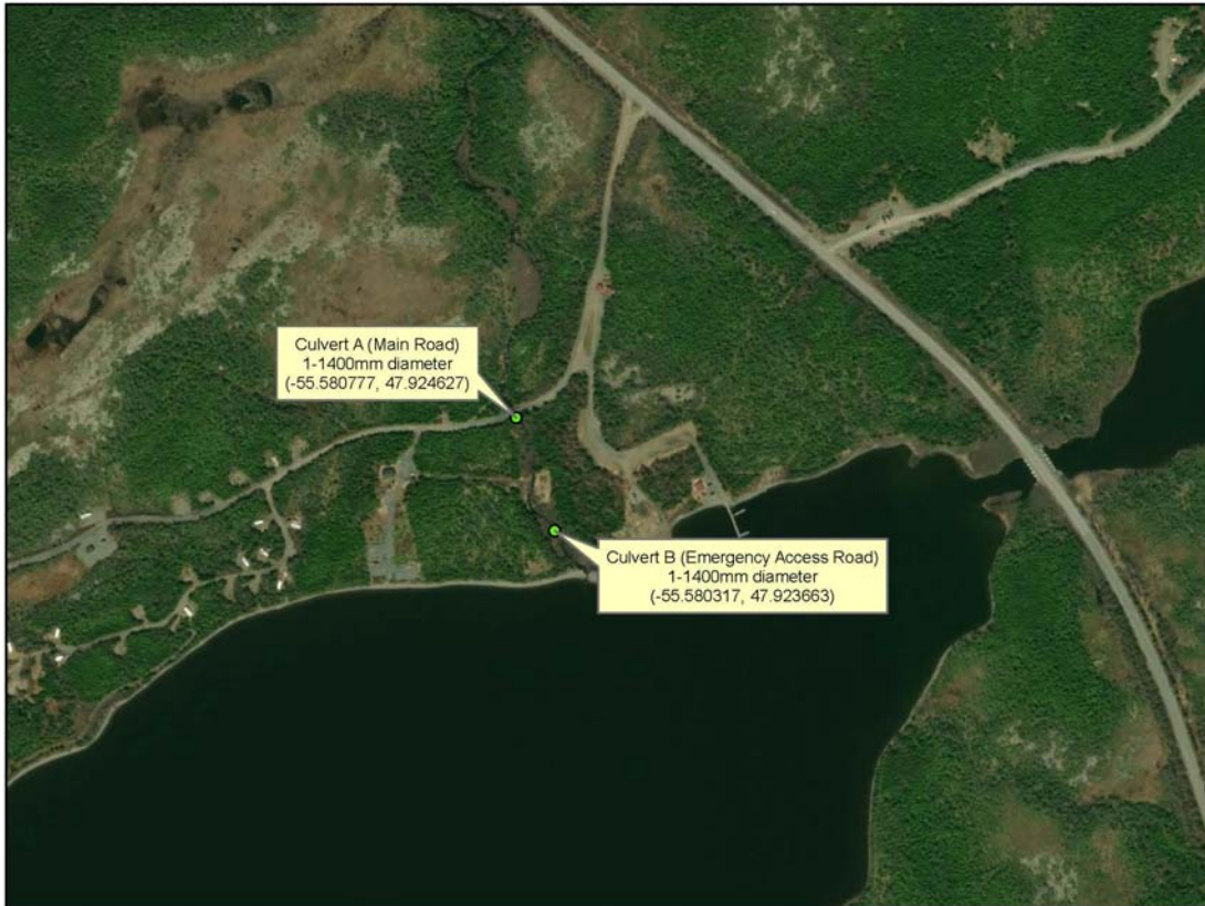
Jipujij Park Culverts near Conne River