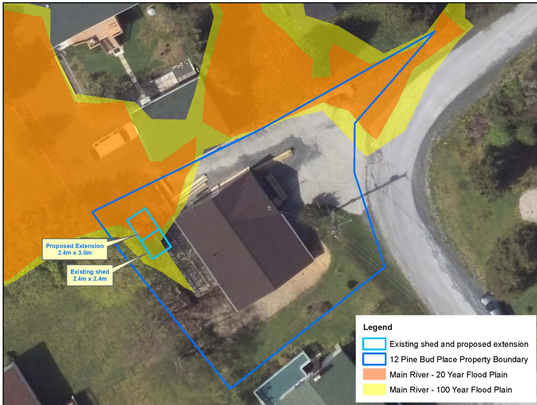
12 Pine Bud Place, Portugal Cove-St. Philip's