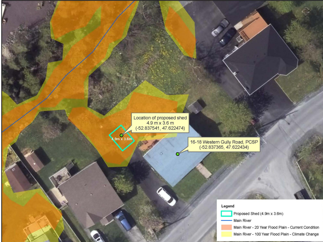
Town of Portugal Cove-St. Philip's - Designated floodplain