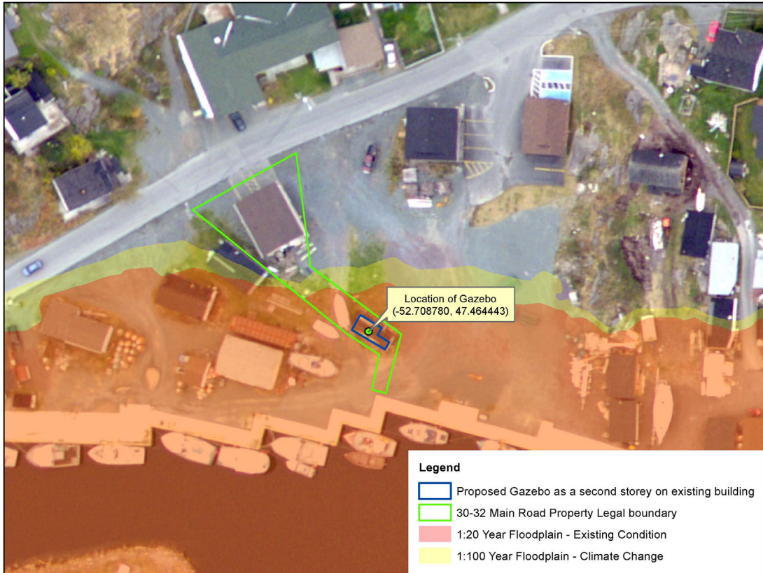
Floodplain Mapping for the Town of Petty Harbour/Maddox Cove