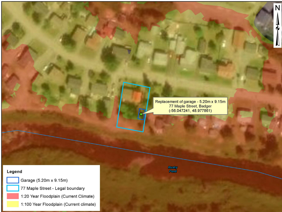
Designated Floodplain Mapping for 77 Maple Street, Badger