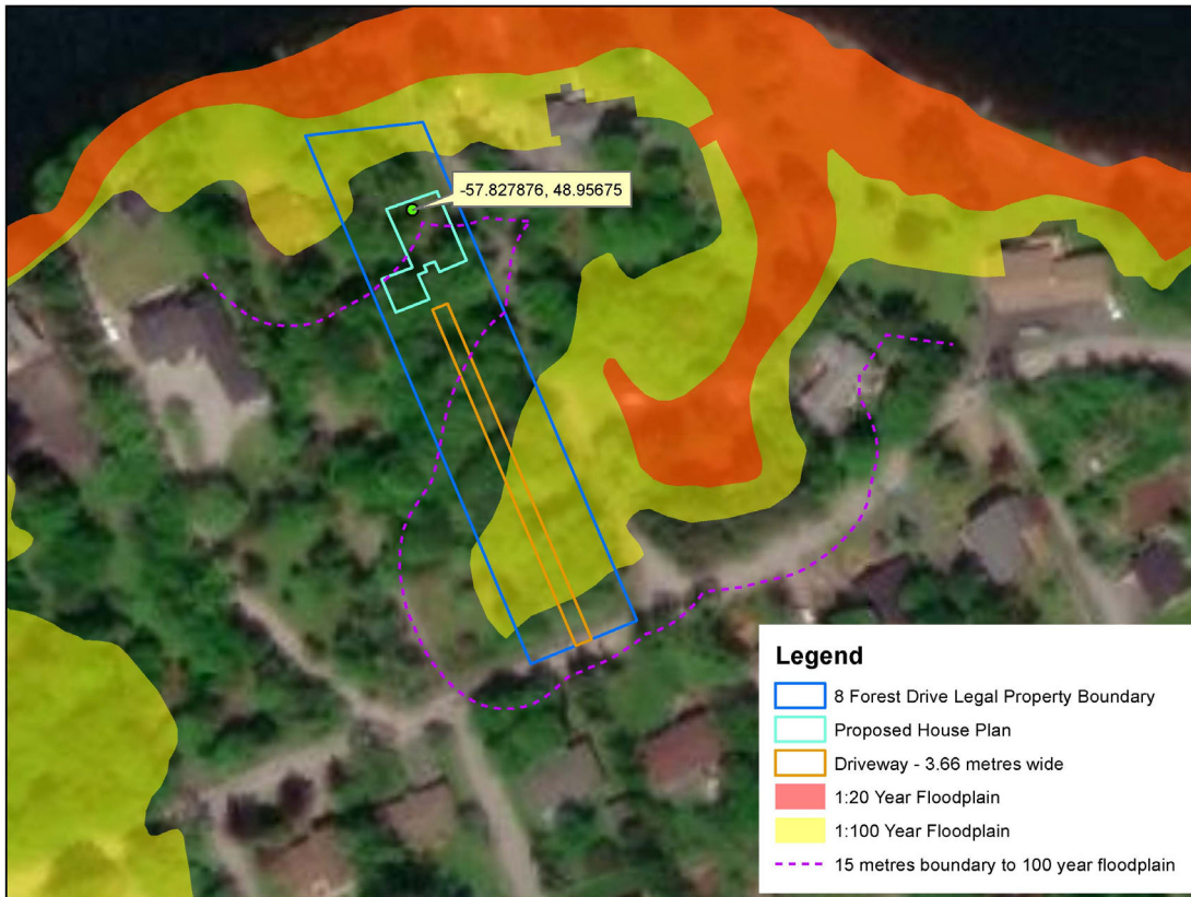
Floodplain Mapping at 8 Forest Drive in Steady Brook