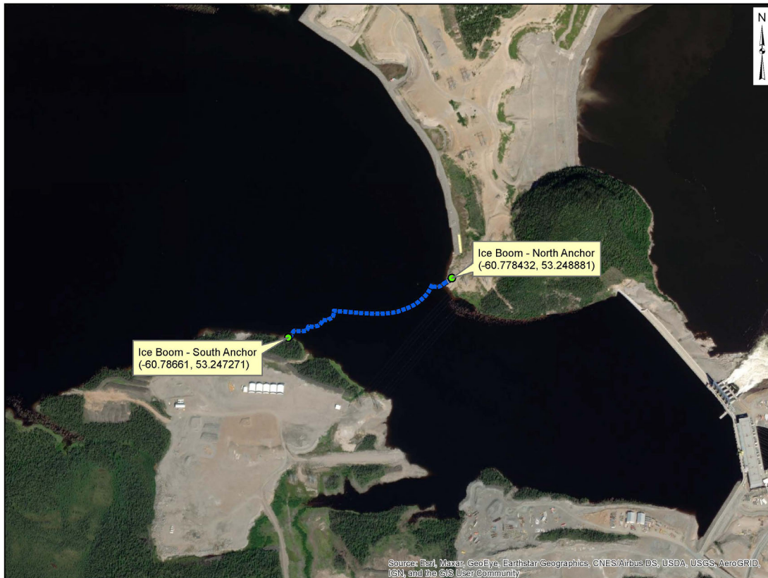
Ice Boom Upstream of Muskrat Falls Dam