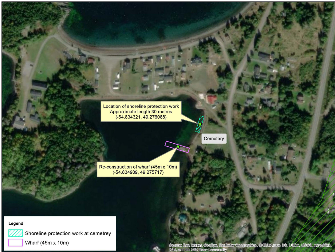
Shoreline Protection Work and Re-construction of Wharf in the Community of Loon Bay