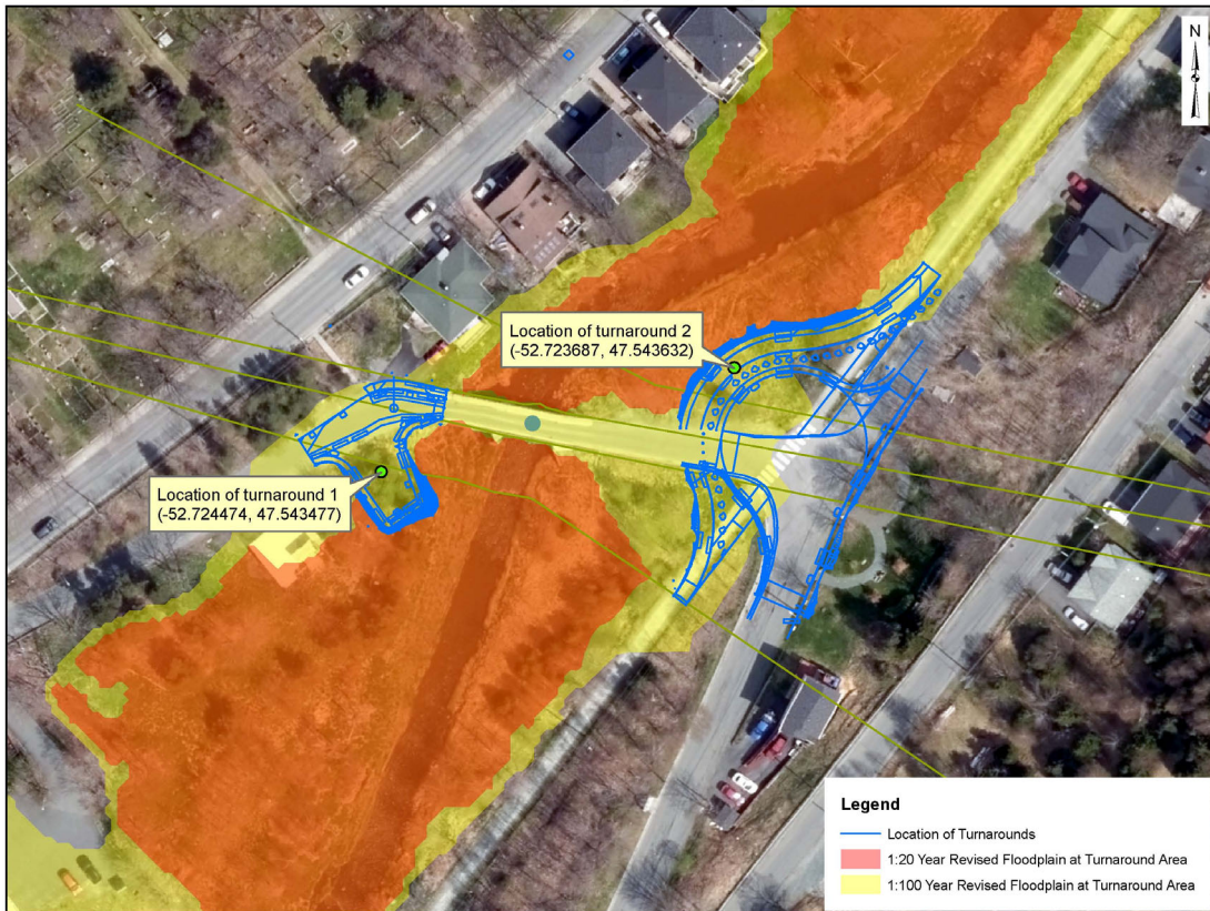
Waterford River Floodplain at Symes Bridge Road, St. John's