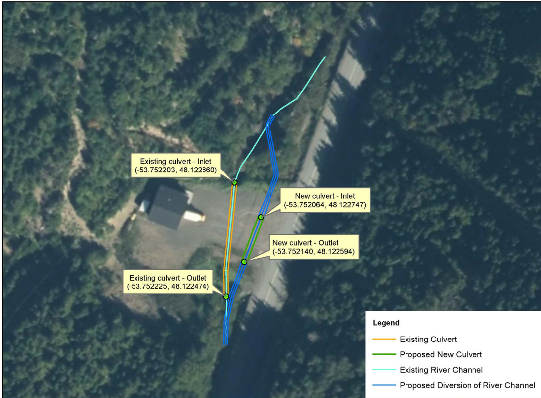
Random Island East Fire Hall Stream Diversion and Culvert Replacement Local Service District of Lower Lance Cove