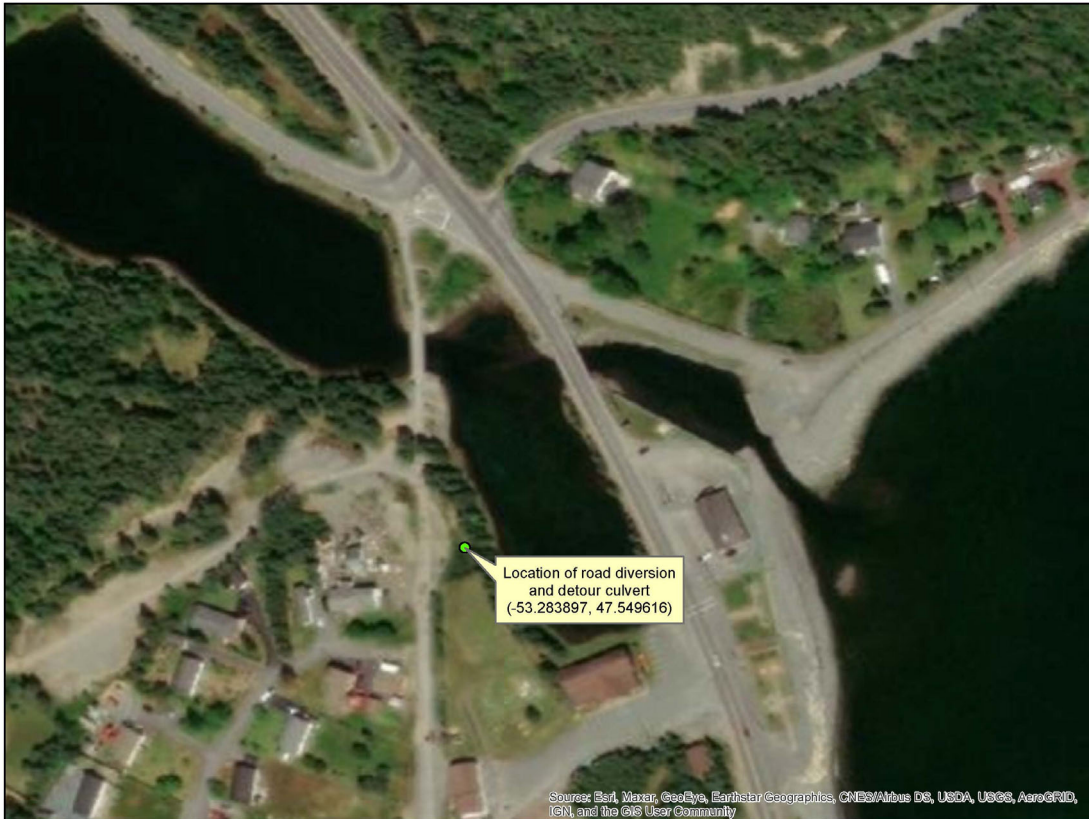
Location of detour culvert and road diversion for North River Bridge Replacement at Route 70