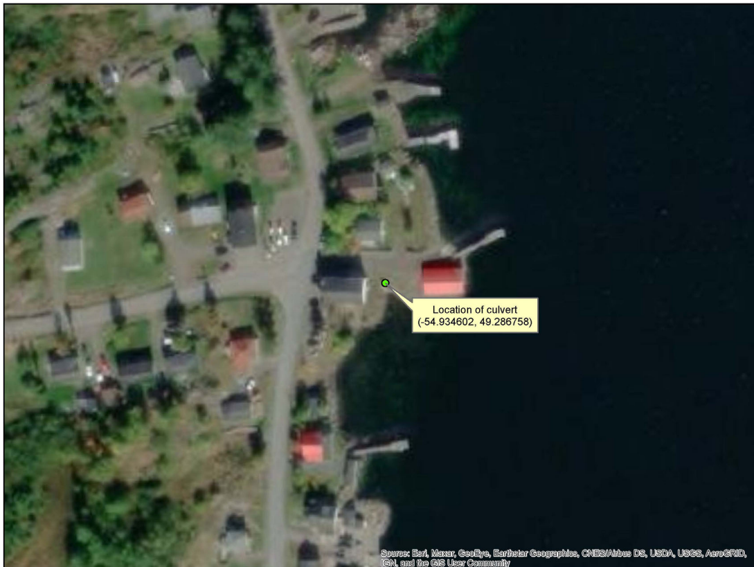
Replacement of culvert at Bob Clarke Drive in Campbellton