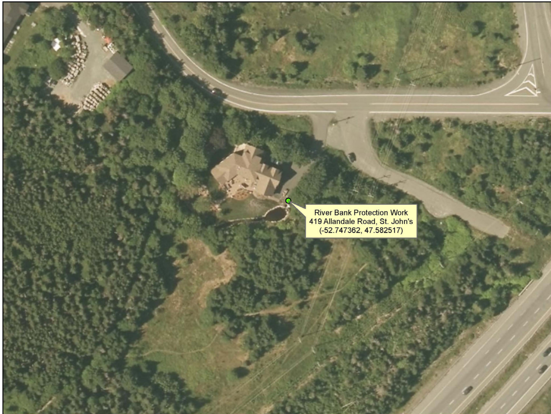
River Bank Protection Work at 419 Allandale Road, St. John's