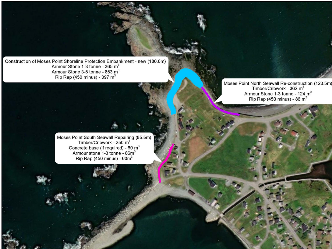
Town of Bonavista Shoreline Protection Work Location Map 1