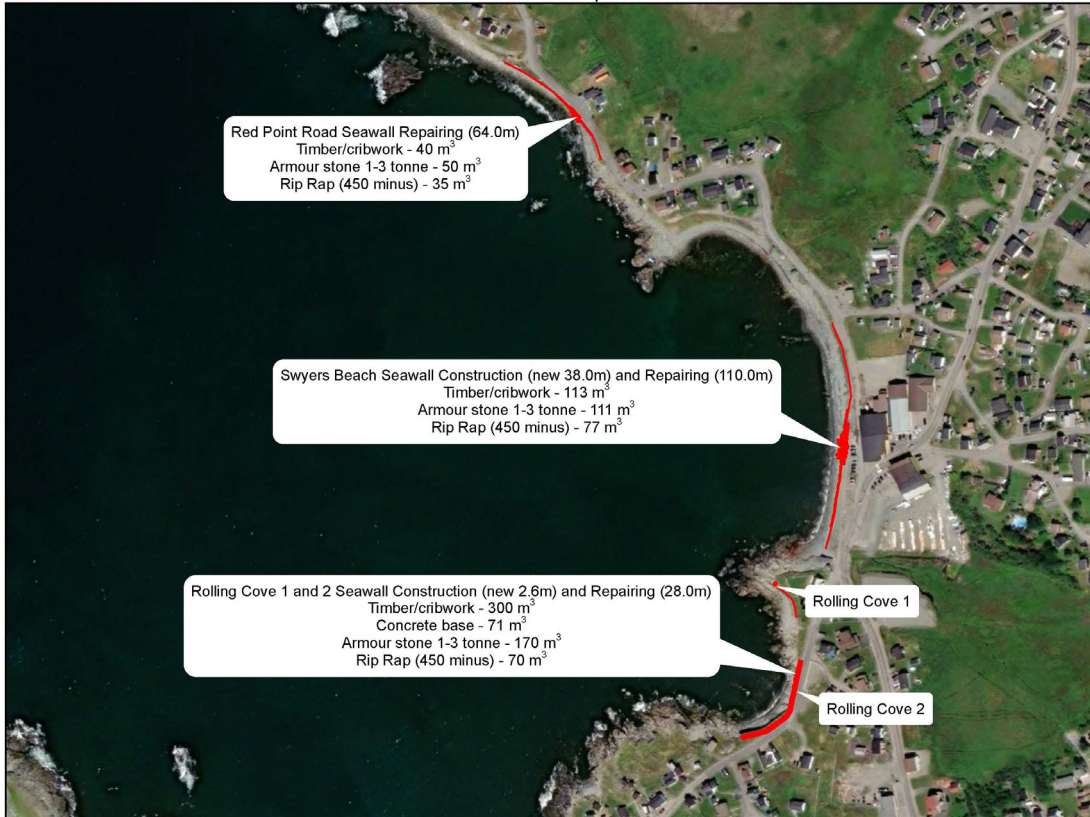
Town of Bonavista Shoreline Protection Work Location Map 3