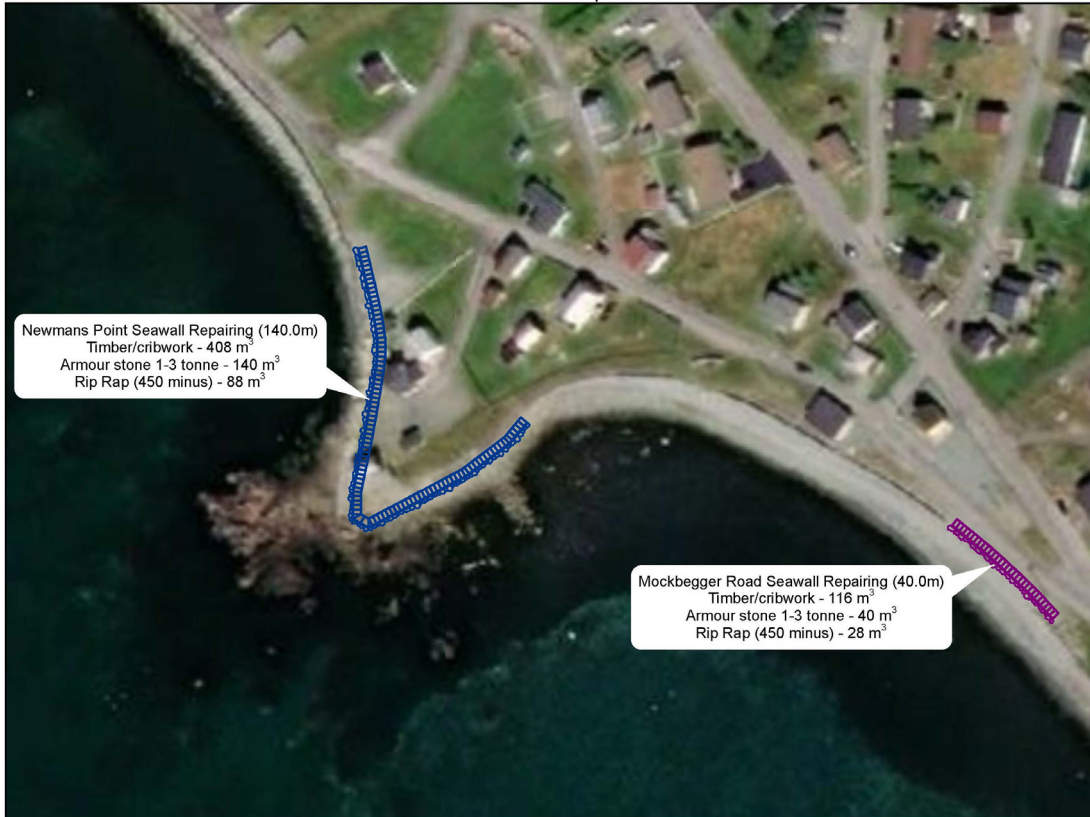
Town of Bonavista Shoreline Protection Work Location Map 2