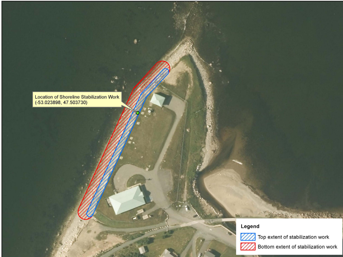
Shoreline Stabilization Work at Wastewater Treatment Plant in Conception Bay South