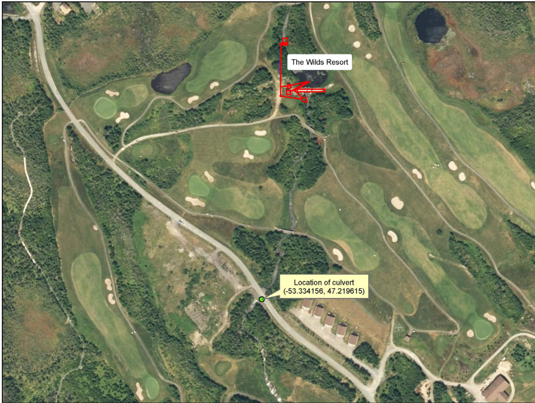
Culvert replacement near The Wilds Resort in Salmonier Line