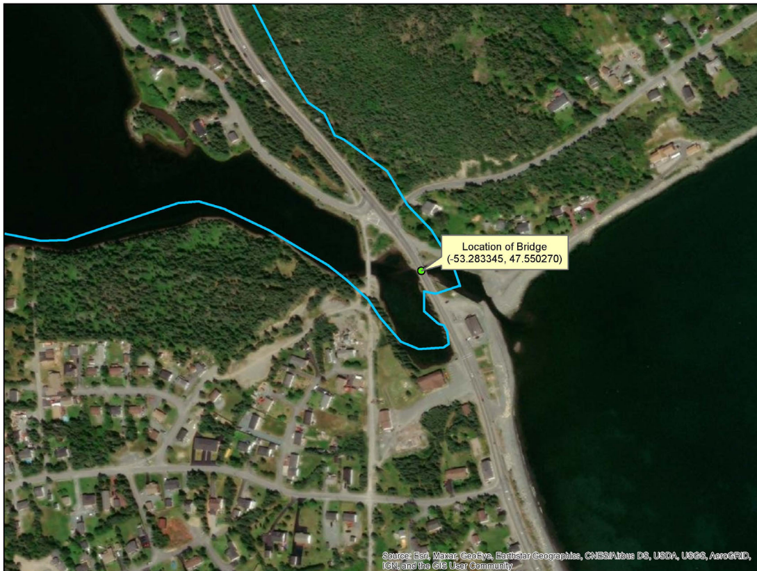
Location of North River Bridge Replacement at km 16 of Route 70