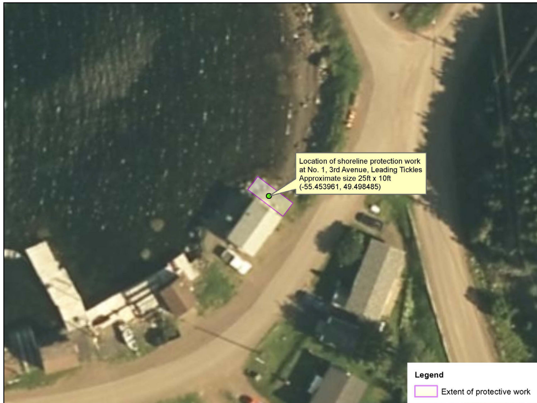
Shoreline Protection Work at No. 1, 3rd Avenue, Leading Tickle