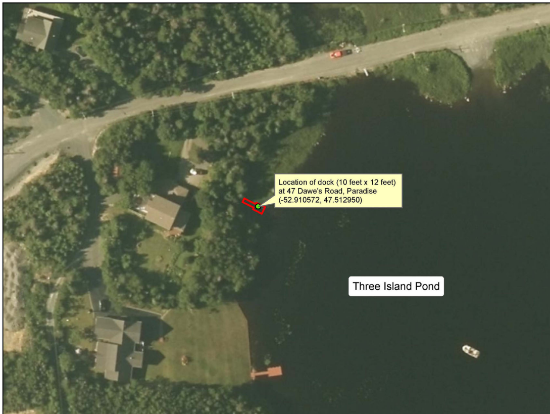
Construction of a dock at 47 Dawe's Road, Paradise