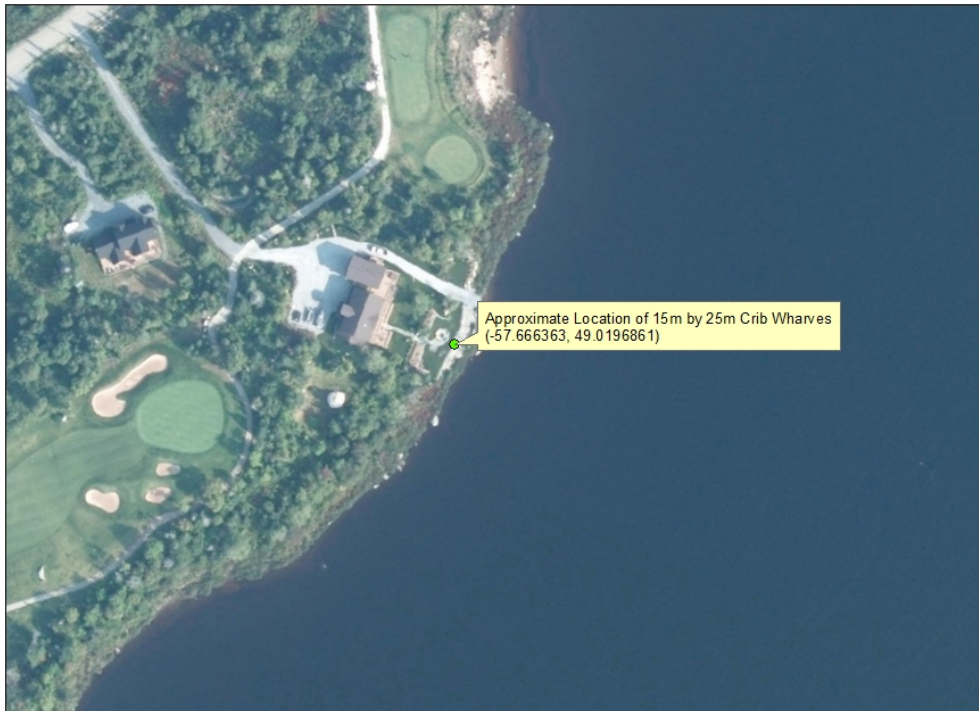
Two Crib Wharves in Deer Lake at 20 Beach Place, Humber Valley Resort