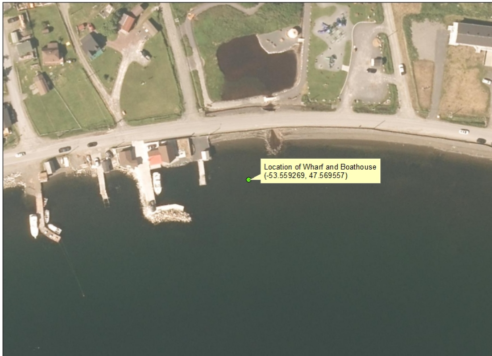
Construction of a Wharf and Boathouse in Dildo Cove, Dildo