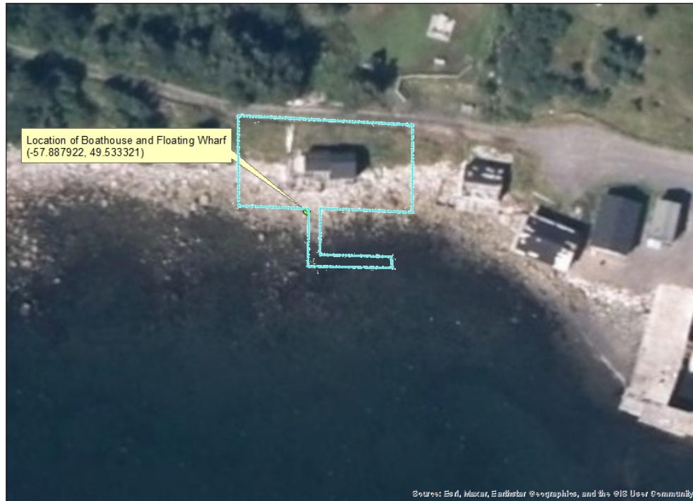
Infilling for Boathouse and Floating Wharf Construction at Wild Cove, Town of Norris Point