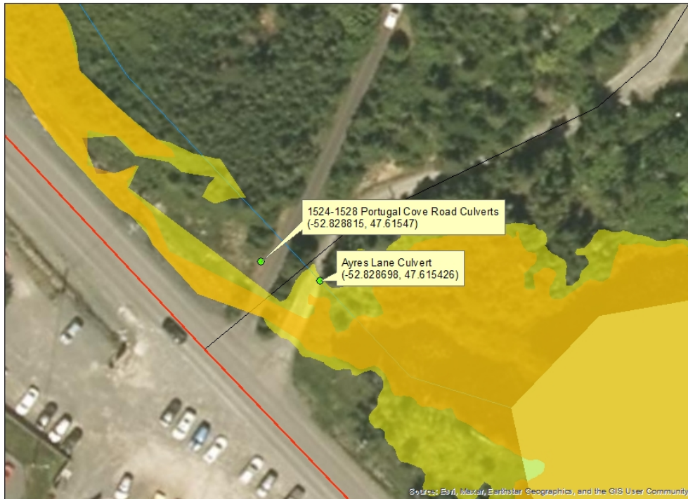
Culvert Replacements at 1524-1528 Portugal Cove Road and Ayres Lane in Portugal Cove - St. Phillip's