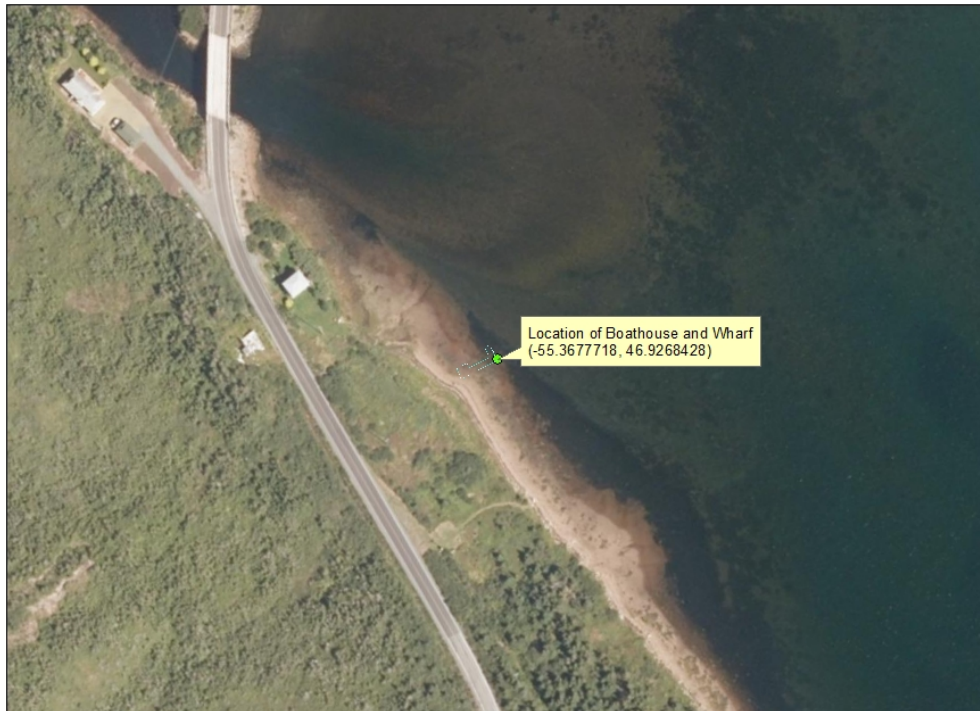
Construction of a Boathouse and Wharf in St. Lawrence