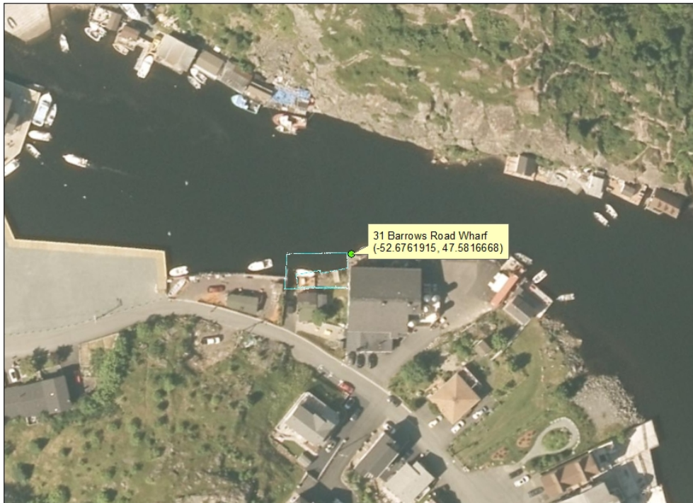
Wharf Construction in Quidi Vidi Harbour, St. John's