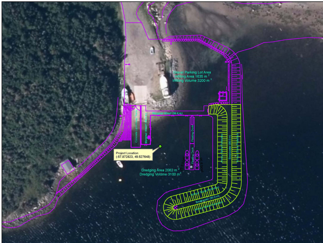
Development of DFO Small Craft Harbour at Norris Point (Neddy Harbour)