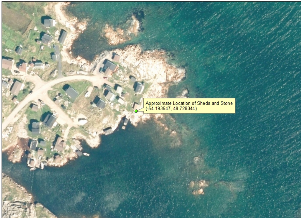
Placement of Sheds and Crushed Stones at 86 Little Harbour Road, Fogo Island