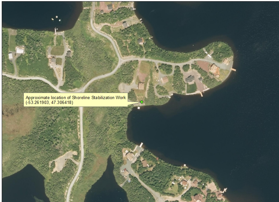
Shoreline Stabilization at Lot 5 Belbins Mill Pond, Salmonier Line