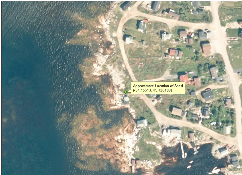
Placement of an Existing Shed at 9 Penton's Road, Joe Batt's Arm, Town of Fogo Island