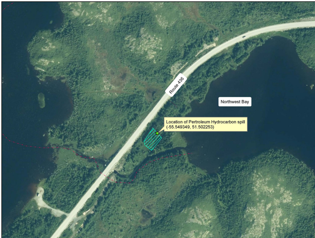
Petroleum Hydrocarbon spill on Route 436, southeast of St. Lunaire