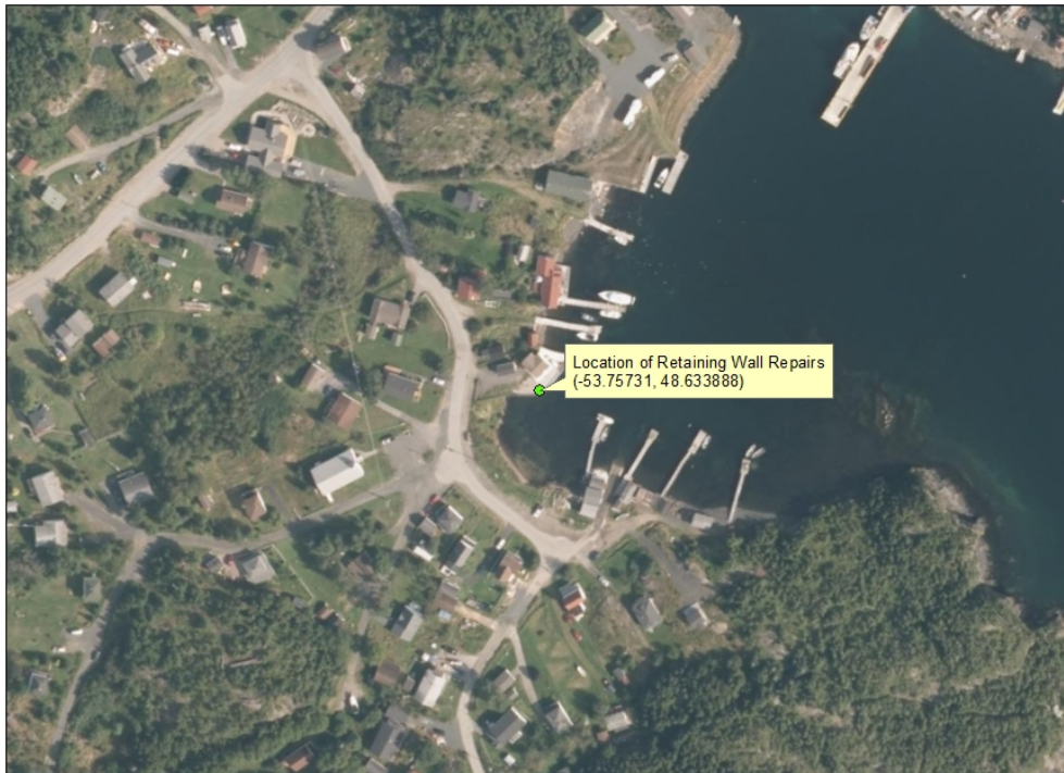
Repiaring an Existing Retaining Wall in Happy Adventure