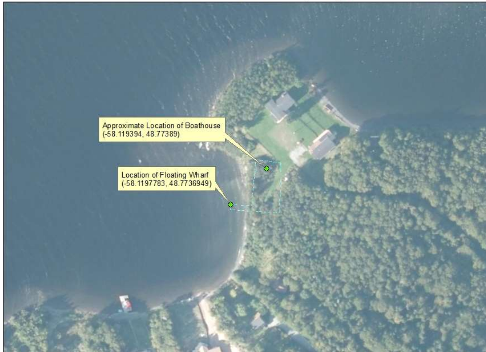
Construction at 18 Beaver Pond Road, George's Lake