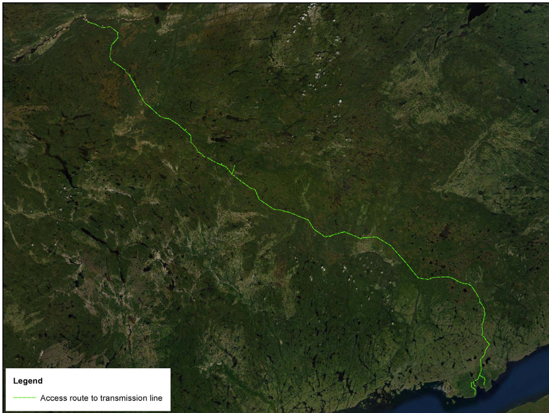
Access route to Labrador-Island Transmission Link - Labrador Portion