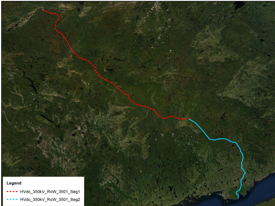
Right of Way (RoW) of Labrador-Island Transmission Link - Labrador Portion