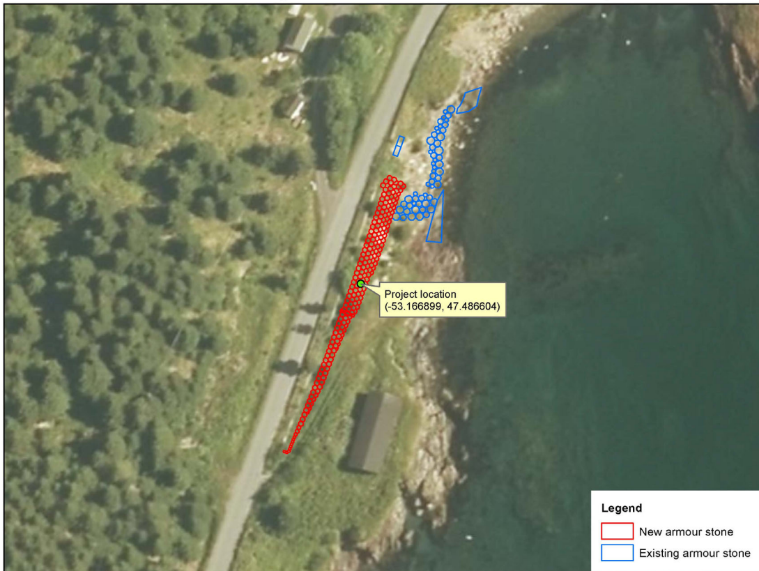
Armour stone placement along the shoulder of Bacon Cove Road, Conception Harbour