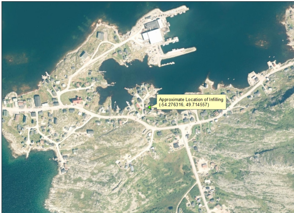
Infilling at 6 Little Harbour Road in the Town of Fogo Island