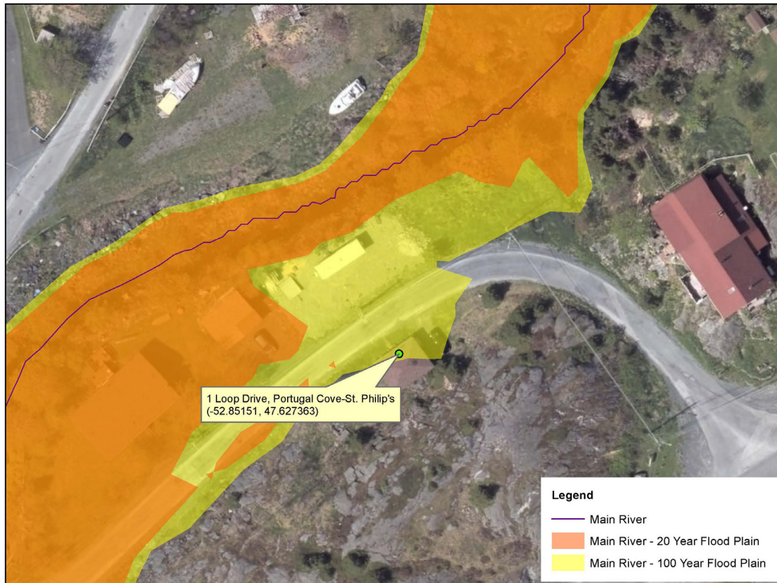
Flood Plain Mapping of Main River for the Town of Portugal Cove-St. Philip's