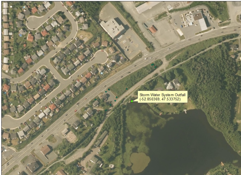
1397 Topsail Road, Storm Water Sytem Extension