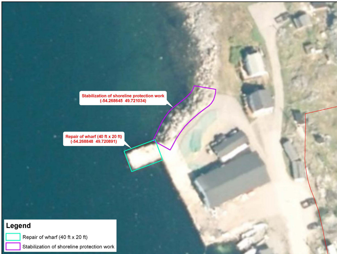
Best Fisheries Inc. at 145 Main Street in Fogo (An outport of Fogo Island)