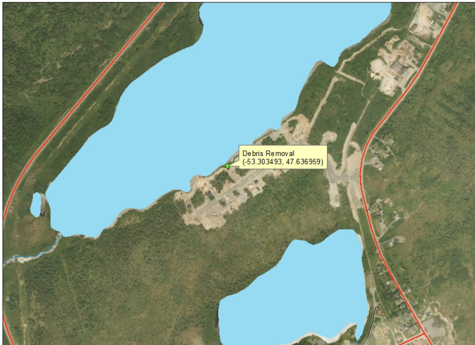
Debris Removal and Improvements at 42 Jack Pine Drive