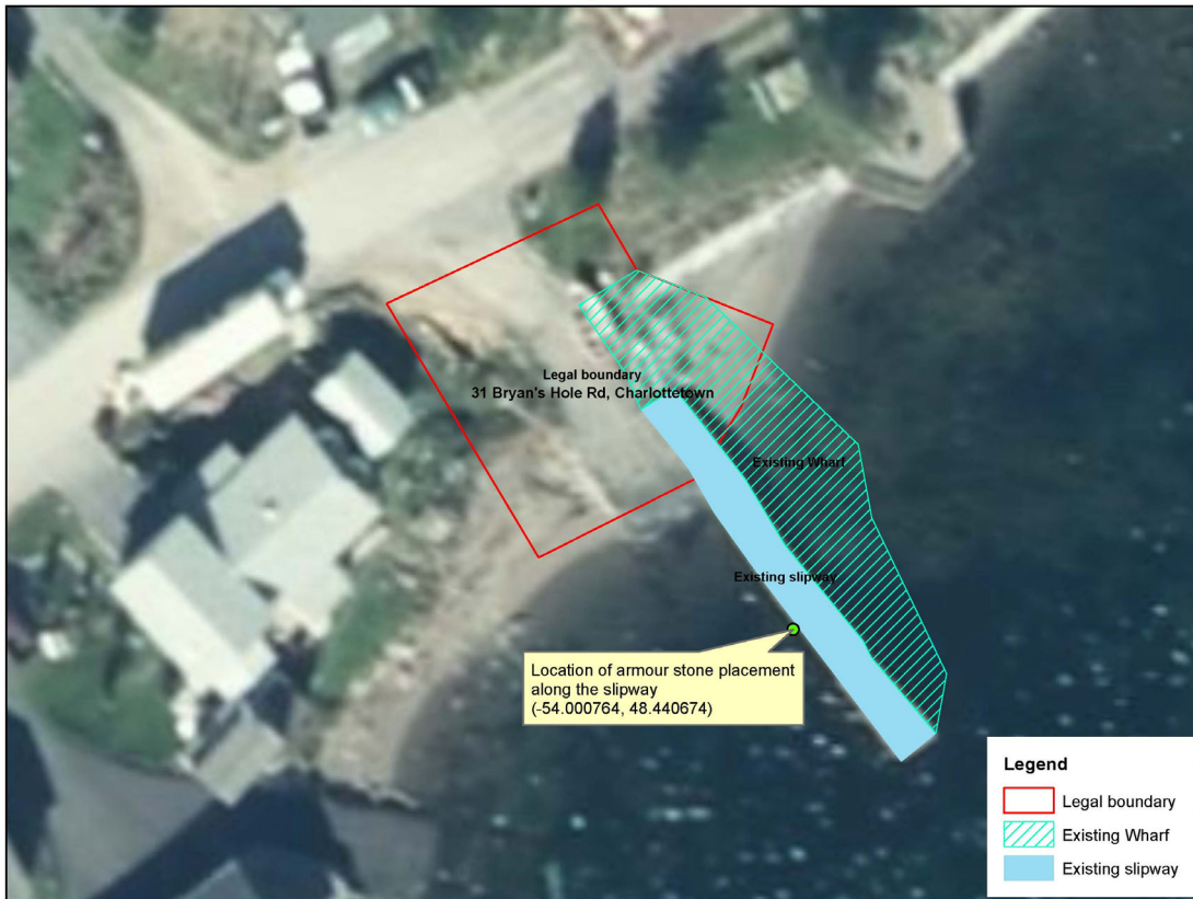
Slipway and wharf at 31 Bryan's Hole Rd, Charlottetown