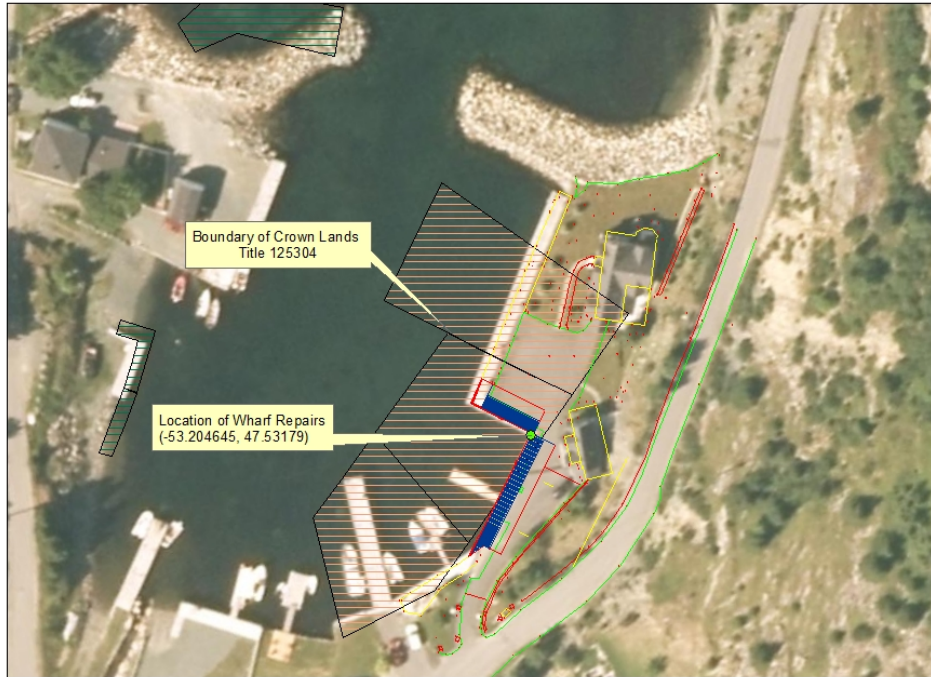
Repairs to Existing Wharf/Retaining Wall at 25 Antle's Beach, Brigus