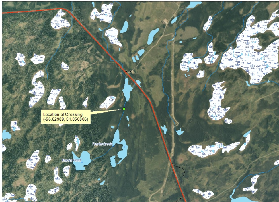
Fording of Beaver House Pond Brook