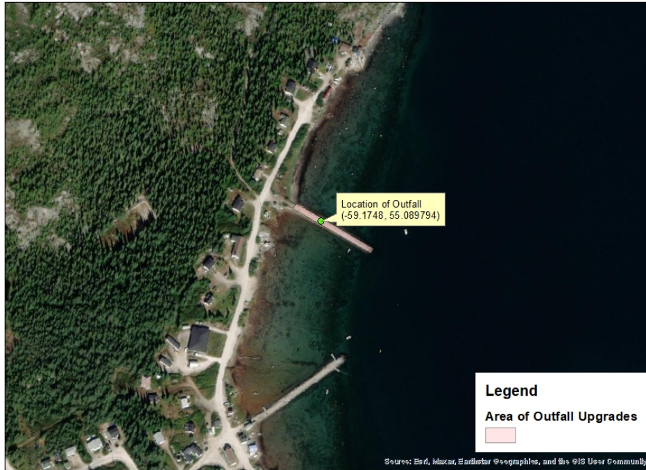
Outfall Upgrades in the Town of Makkovik